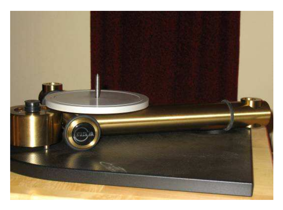
Position T base for two tonearms 12& 9 inch + motor tower Fig 6.

Remove the foam and lift the main T base (fig. 3) of turntable carefully as it is heavy and put it on a shelf so that the side with the bearing is situated at 8 o' clock and the side with the tonearm mounts at 2' o clock. But due its size it will not fit standard Stab S base. See fig 6.