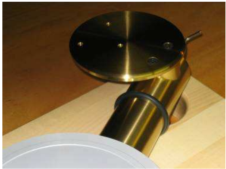
Circular brass armbase Fig 7.

Remove the brass pillar and find underneath two threaded holes. Find the circular brass arm base (optional) with appropriate cut-out. Using Allen key (3 mm) and two screws fit this onto the pillar. Insert back into T base and, with tonearm protractor, position the brass plate correctly by rotating the brass pillar while releasing the VTA screw with Allen key (3mm). See fig. 7. Follow tonearm mounting instructions. It is possible that in some circumstances the lid provided may not fit.