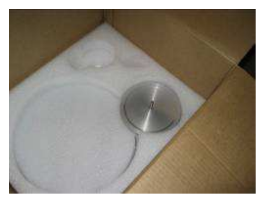
Unpacking: subplatter Fig 4.