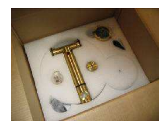
Unpacking: T base and parts Fig 3.

Stogi S tonearm with its own accessories Clamp (in box- see Fig 3) Wooden platform (on top of the box)